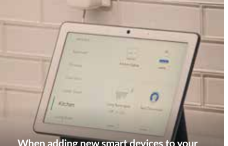
When adding new smart devices to your home, replace the default usernames and passwords with strong and unique versions, and keep software up to date.

Smart technologies have proliferated as the 'internet of things' has grown to include home security and safety systems, lighting, entertainment, HVAC systems, and even appliances.